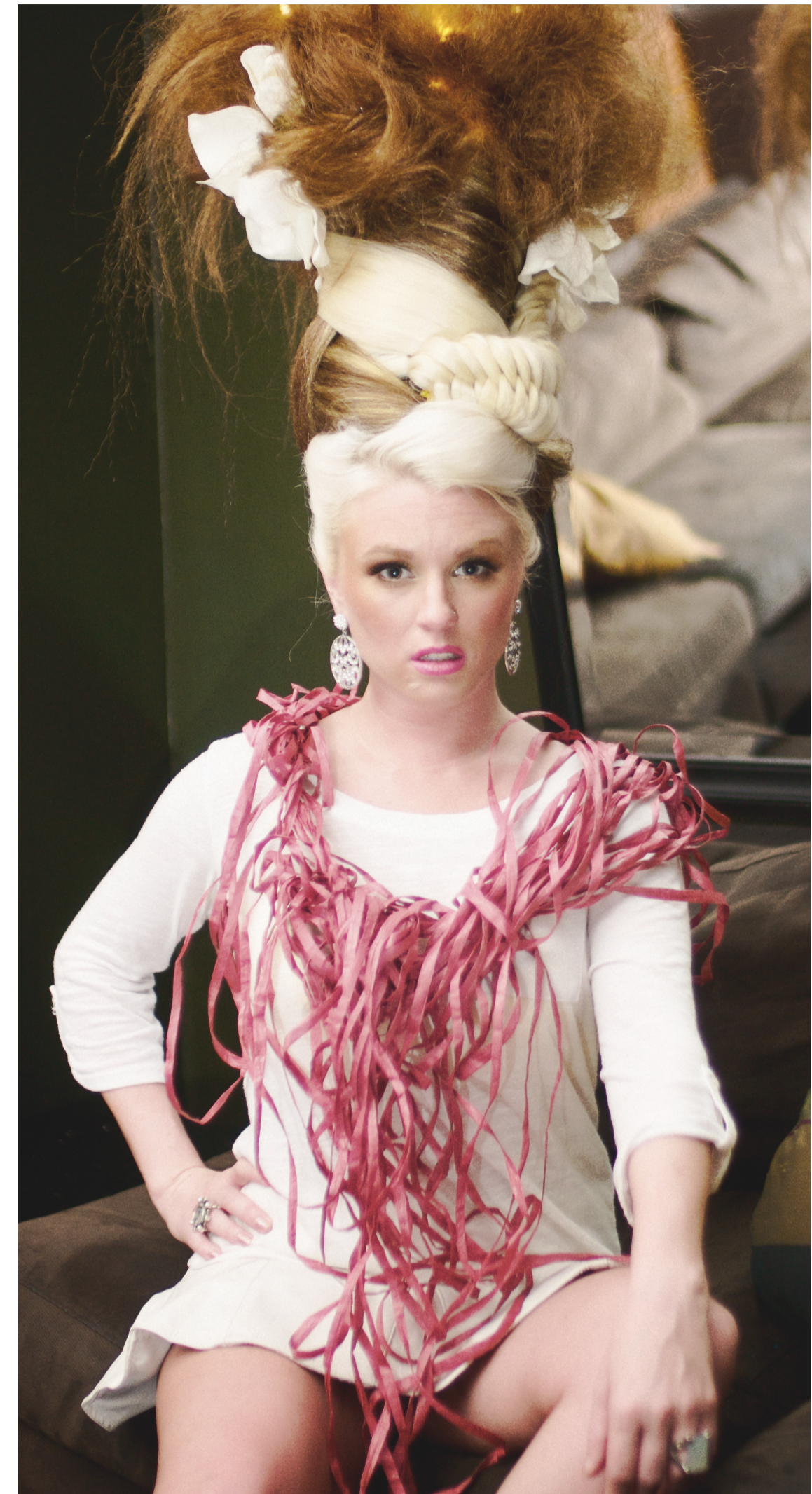
MODEL: WHITNEY STAR (MM#1117984)